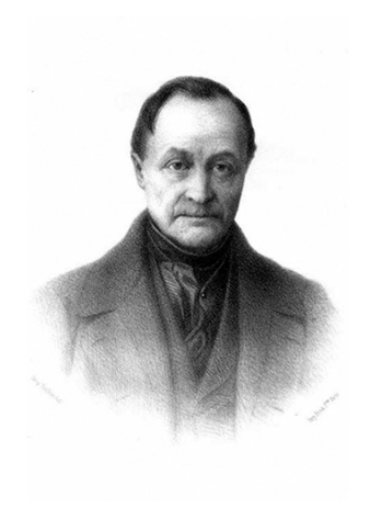
Figure 5. Auguste Comte played an important role in the development of sociology as a recognized discipline.