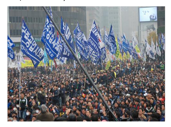
Figure 7. Sociologists develop theories to explain social occurrences such as protest rallies.

Sociologists study social events, interactions, and patterns, and they develop a theory in an attempt to explain why things work as they do (Figure 7) . In sociology, a theory is a way to explain different aspects of social interactions and to create a testable proposition, called a hypothesis , about society.<sup>20</sup>