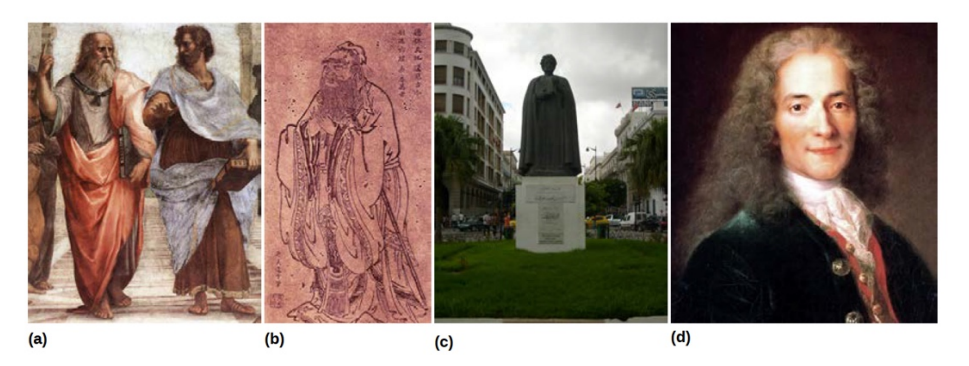
Figure 4. People have been thinking like sociologists long before sociology became a separate academic discipline: Plato and Aristotle, Confucius, Khaldun, and Voltaire all set the stage for modern sociology.

they belong. Many topics studied in modern sociology were also studied by ancient philosophers in their desire to describe an ideal society, including theories of social conflict, economics, social cohesion, and power (Figure 4).