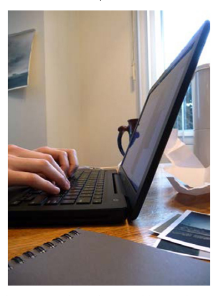
Figure 8. Some sociologists see the online world contributing to the creation of an emerging global culture. Are you a part of any global communities?

Sociologists research many different aspects of this potential global culture. Some explore the dynamics involved in the social interactions of global online communities, such as when members feel a closer kinship to other group members than to people residing in their own countries (Figure 8). Other sociologists study the impact this growing international culture has on smaller, less-powerful local cultures. Yet other researchers explore how international markets and the outsourcing of labor impact social inequalities. Sociology can play a key role in people's abilities to understand the nature of this emerging global culture and how to respond to it.