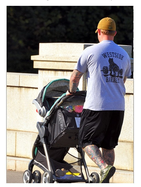
Figure 3. Modern U.S. families may be very different in structure from what was historically typical.

Changes in the U.S. family structure offer an example of patterns that sociologists are interested in studying ( Figure 3 ). A "typical" family now is vastly different than in past decades when most U.S. families consisted of married parents living in a home with their unmarried children. The percent of unmarried couples, same-sex couples, single-parent and single-adult households is increasing, as well as is the number of expanded households, in which extended family members such as grandparents, cousins, or adult children live together in the family home.<sup>3</sup>