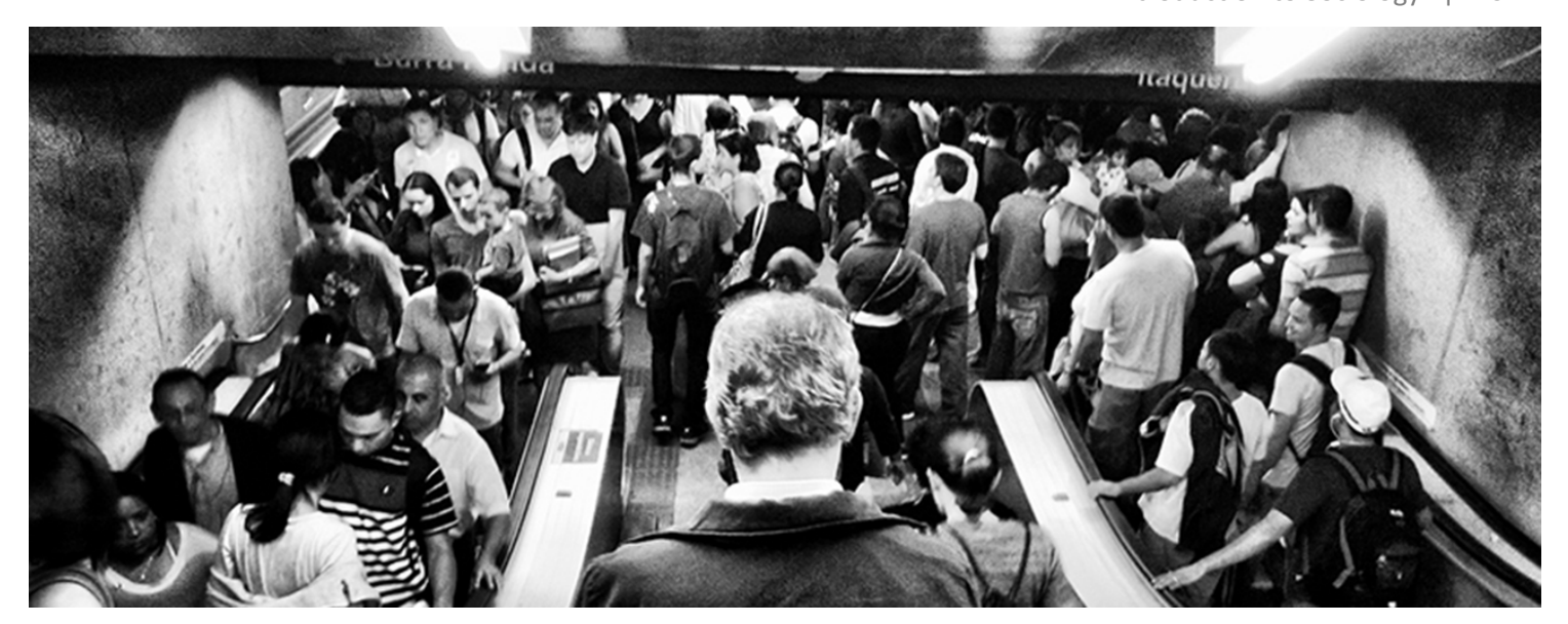
Figure 1. Sociologists study how society affects people and how people affect society.