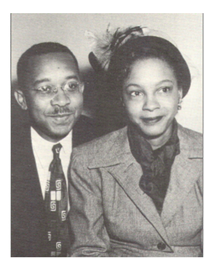
Figure 9. The research of sociologists Kenneth and Mamie Clark helped the Supreme Court decide to end "separate but equal" racial segregation in schools in the United States.

Since it was first founded, many people interested in sociology have been driven by the scholarly desire to contribute knowledge to this field, while others have seen it as a way not only to study society but also to improve it. Besides desegregation, sociology has played a crucial role in many important social reforms, such as equal opportunity for women in the workplace, improved treatment for individuals with mental handicaps or learning disabilities, increased accessibility and accommodation for people with physical handicaps, the right of native populations to preserve their land and culture, and prison system reforms.