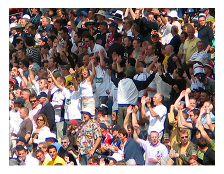
Figure 2. Sociologists learn about society as a whole while studying one-to-one and group interactions.

One illustration of this is a person's decision to marry. In the United States, this choice is heavily influenced by individual feelings; however, the social acceptability of marriage relative to the person's circumstances also plays a part. Remember, though, that culture is a product of the people in a society; sociologists take care not to treat the concept of "culture" as though it were alive in its own right. Reification is an error of treating an abstract concept as though it has a real, material existence.<sup>2</sup>